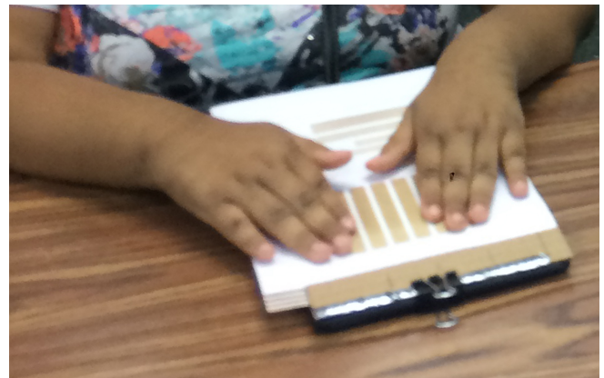
Figure 2. A user with visual impairment handling the self-identified tactile sheets application with a capacitive touch screen device.

Once the participants were familiarized with the content exploration application, they explored the layout and content of the textbook for 10 minutes using the tactile overlays. For this, they took the numbered page they wanted to study out of a folder and placed it on the tablet. Subsequently, they were given a number of tasks typical for teacher-student interactions, such as to go to a section with exercises or look for paragraphs with definitions and highlighted terms. Afterwards, we interviewed the participants about their experience.